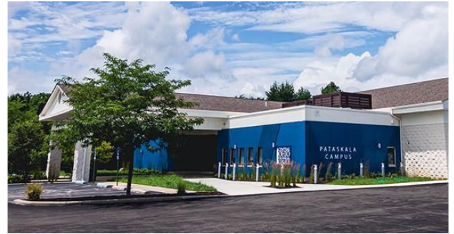
The Pataskala Campus