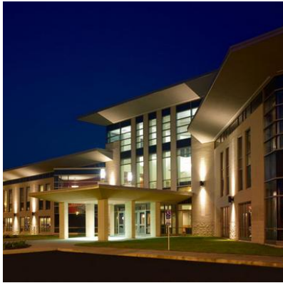
The Newark campus