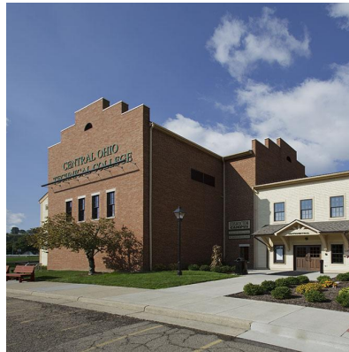
The Coshocton campus